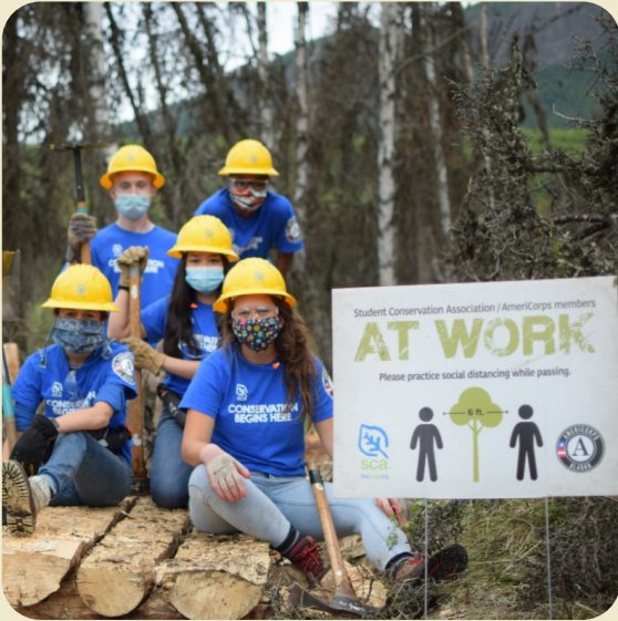
Student Conservation Crew building new trails and park facilities at Settlers Bay Coastal Park.